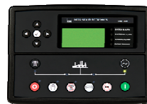
DSE-7320 Remote Control Panel