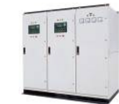
DSE-550 Parallel Control Panel system